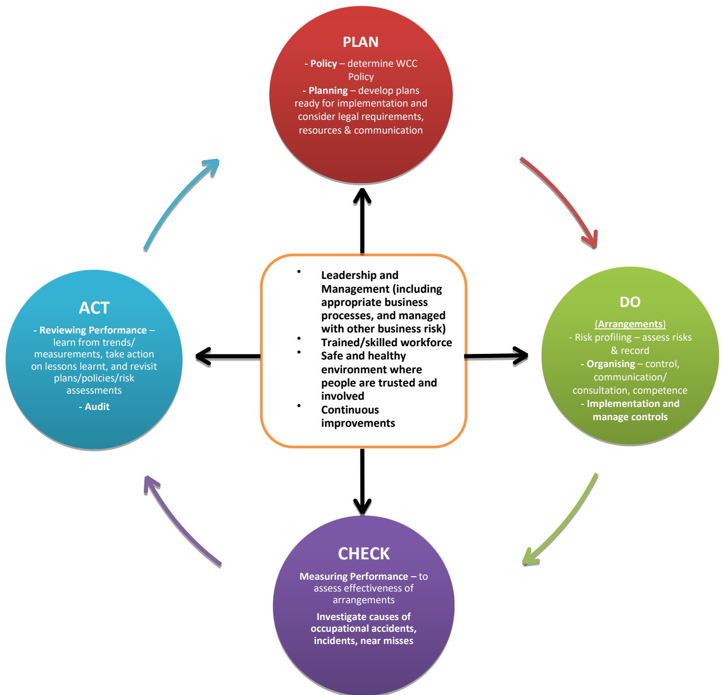
(Figure 1: WCC's in-house occupational health and safety management system)